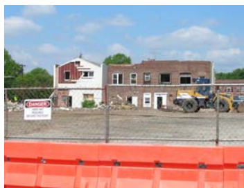
Gentrification in Englewood, 2005