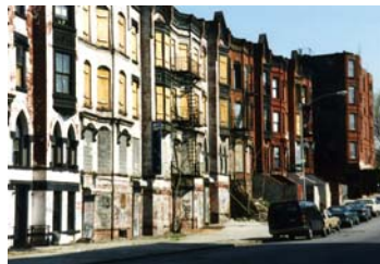
Planned shrinkage in Harlem, 1995