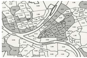
Segregation in Pittsburgh, 1930 Map by Joe Darden